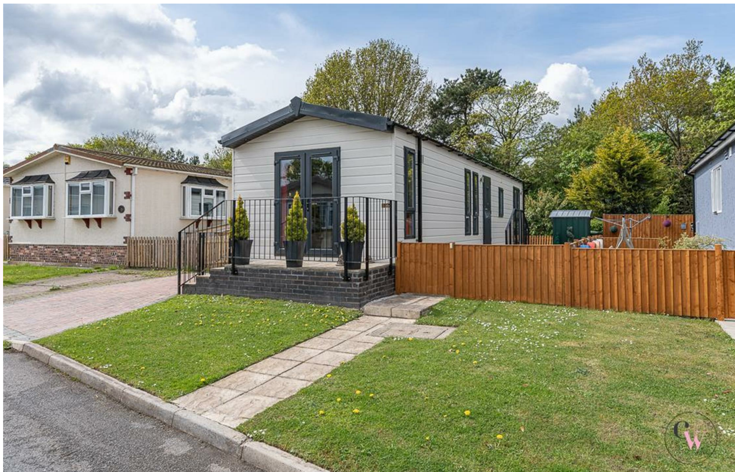
Lee Green Lane, Church Minshull, Nantwich CW5 6ED